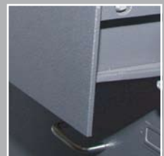
steel plate drawers